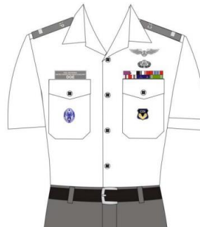
Aviator Shirt Uniform