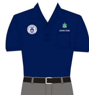
Corporate Working Uniform

In all cases, it is ultimately the member’s responsibility to equip him or herself with the correct and complete CAP uniform.