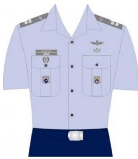
Blue Service Uniform (“Class B”)

The “minimum basic uniform” required for senior members is either the CAP-distinctive Aviator Shirt uniform or the USAF-style Blue Service Uniform (“class B”). These combinations meet the requirements of most CAP events.